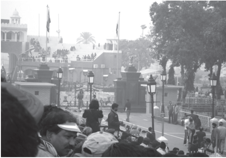
Fig. 10.1 Wagah Border is not only a tourist place but also used for trade between India and Pakistan

goods. At this stage, enterprises owned by government (known as State Owned Enterprises—SOEs), which we, in India, call public sector enterprises, were made to face competition. The reform process also involved dual pricing. This means fixing the prices in two ways; farmers and industrial units were required to buy and sell fixed quantities of inputs and outputs on the basis of prices fixed by the government and the rest were purchased and sold at market prices. Over the years, as production increased, the proportion of goods or inputs transacted in the market also increased. In order to attract foreign investors, special economic zones were set up.