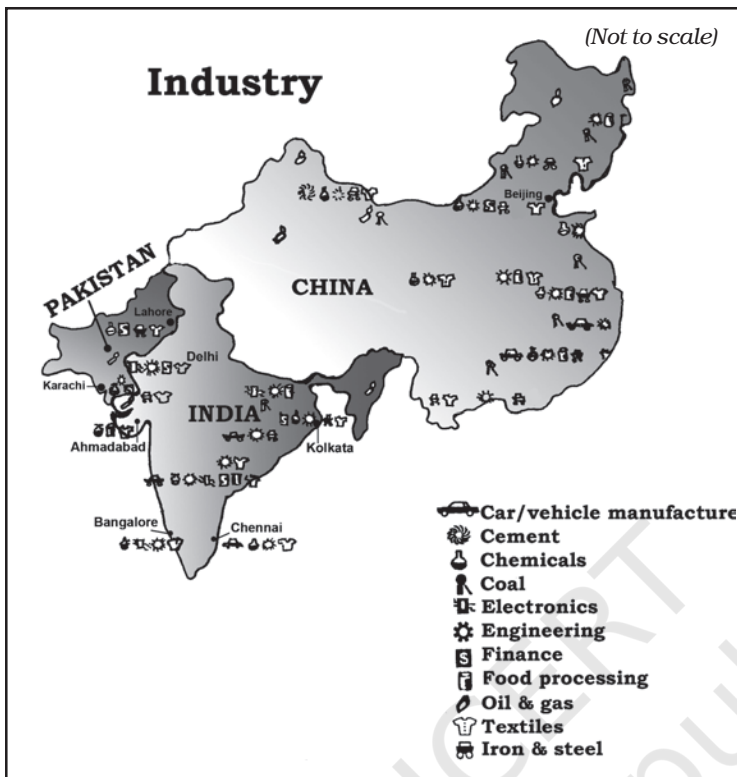
Fig. 10.3 Industry in India, China and Pakistan

Pakistan have more proportion of urban population than India. In China, due to topographic and climatic conditions, the area suitable for cultivation is relatively small — only about 10 per cent of its total land area. The total cultivable area in China accounts for 40 per cent of the cultivable area in India. Until the 1980s, more than 80 per cent of the people in China were dependent on farming as their sole source of livelihood. Since then, the government encouraged people to leave their fields and pursue other activities such as handicrafts, commerce and transport. In 2018–