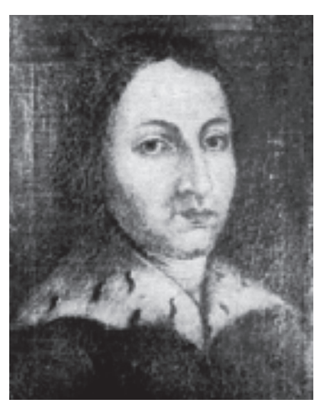
Self-portrait by Copernicus.

Celestial means divine or heavenly, while terrestrial implies having a worldly quality.