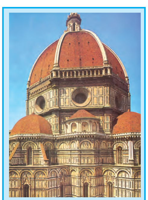
The Duomo, the dome of Florence cathedral designed by Brunelleschi.

Another remarkable change was that from this time, artists were known individually, by name, not as members of a group or a guild, as earlier.