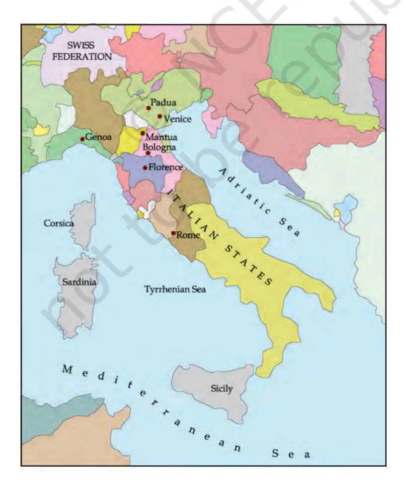
MAP 1: The Italian States

With the expansion of trade between the Byzantine Empire and the Islamic countries, the ports on the Italian coast revived. From the twelfth century, as the Mongols opened up trade with China via the Silk Route (see Theme 5) and as trade with western European countries