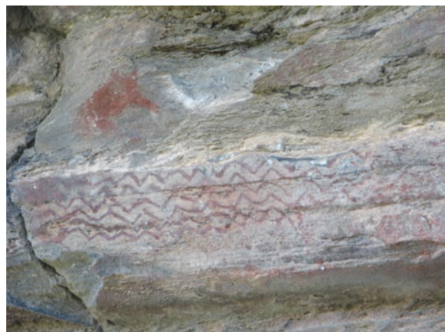
Wavy lines, Lakhudiyar, Uttarakhand