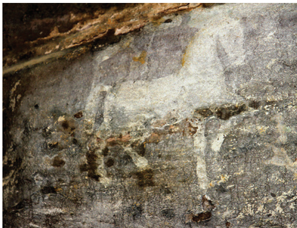
One of the few images showing only one animal, Bhimbetka

The artists of Bhimbetka used many colours, including various shades of white, yellow, orange, red ochre, purple, brown, green and black. But white and red were their favourite colours. The paints were made by grinding various rocks and minerals. They got red from haematite (known as geru in India). The green came from a green variety of a stone called chalcedony. White might have been