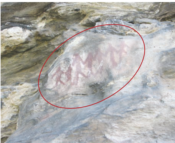
Hand-linked dancing figures, Lakhudiyar, Uttarakhand

Remnants of rock paintings have been found on the walls of the caves situated in several districts of Madhya Pradesh, Uttar Pradesh, Andhra Pradesh, Karnataka and Bihar. Some paintings have been reported from the Kumaon hills in Uttarakhand also. The rock shelters on banks of the River Suyal at Lakhudiyar, about twenty kilometres on the Almora–Barechana road, bear these prehistoric paintings. Lakhudiyar literally means one lakh caves. The paintings here can be divided into three categories: man, animal and geometric patterns in white, black and red ochre. Humans are represented in stick-like forms. A long-snouted animal, a fox and a multiple legged lizard are the main animal motifs. Wavy lines, rectangle-filled geometric designs, and groups of dots can also be seen here. One of the interesting scenes depicted here is of hand-linked dancing human figures. There is some superimposition of paintings. The earliest are in black; over these are red ochre paintings and the last group comprises white paintings. From Kashmir two slabs with engravings have been reported. The granite rocks of Karnataka and Andhra Pradesh provided suitable canvases to the Neolithic man for his paintings. There are several such sites but more famous among them are Kupgallu, Piklihal and Tekkalkota. Three types of paintings have been reported from here—paintings in white, paintings in red ochre over a white background and paintings in red ochre. These