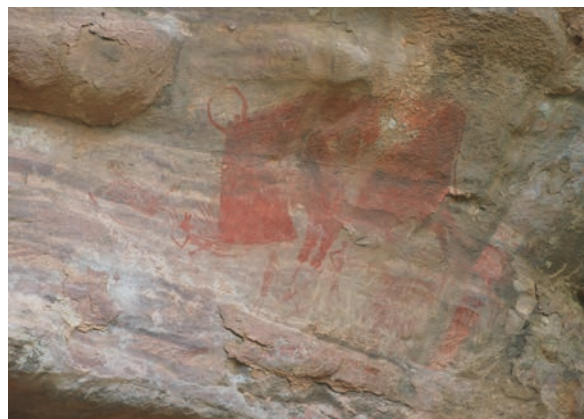
Painting showing a man being hunted by a beast, Bhimbetka

made out of limestone. The rock of mineral was first ground into a powder. This may then have been mixed with water and also with some thick or sticky substance such as animal fat or gum or resin from trees. Brushes were made of plant fibre. What is amazing is that these colours have survived thousands of years of adverse weather conditions. It is believed that the colours have remained intact because of the chemical reaction of the oxide present on the surface of the rocks.