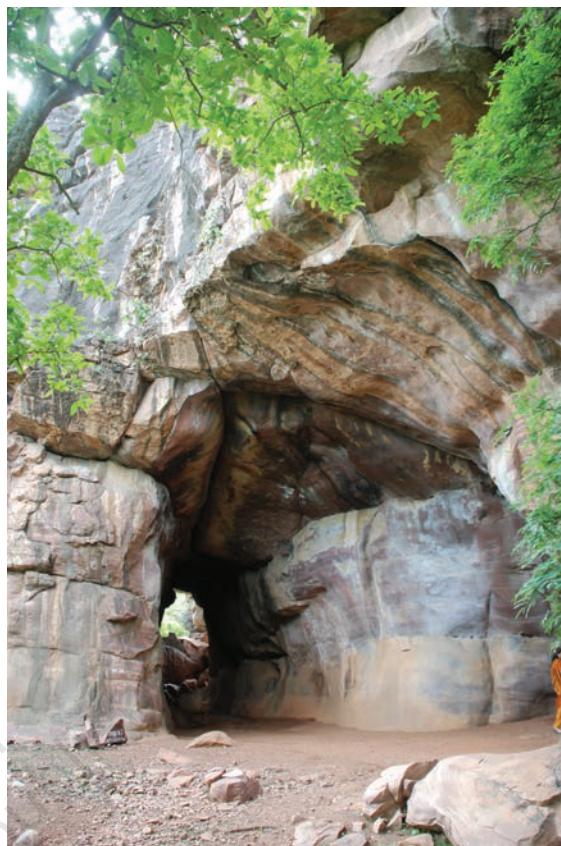
Cave entrance, Bhimbetka, Madhya Pradesh

The paintings of the Upper Palaeolithic phase are linear representations, in green and dark red, of huge animal figures, such as bison, elephants, tigers, rhinos and boars besides stick-like human figures. A few are wash paintings but mostly they are filled with