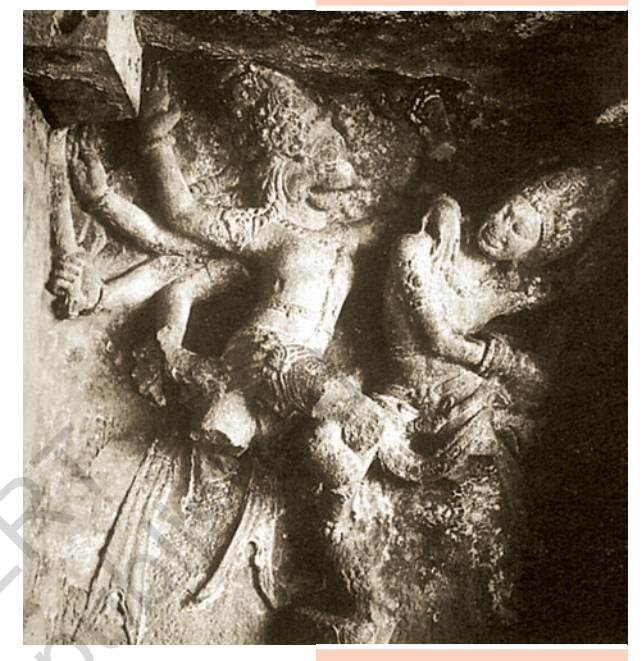
Fig. 1 Wall relief from Cave 15, Ellora, showing Vishnu as Narasimha, the man-lion. It is a work of the Rashtrakuta period.

Many of these new kings adopted high-sounding titles such as maharaja-adhiraja (great king, overlord of kings), tribhuvana-chakravartin (lord of the three worlds) and so on. However, in spite of such claims,