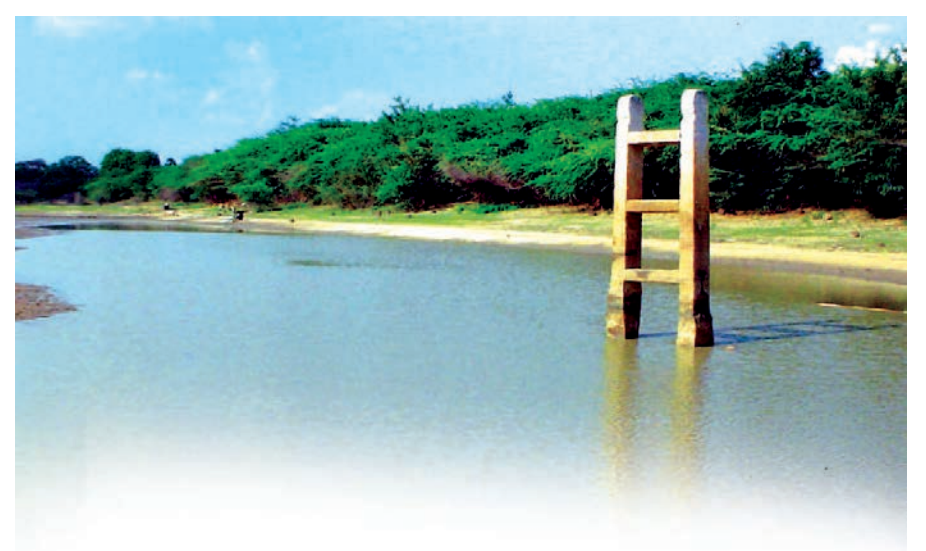
carry water to the fields. In many areas two crops were grown in a year.

In many cases it was necessary to water crops artificially. A variety of methods were used for irrigation. In some areas wells were dug. In other places huge tanks were constructed to collect rainwater. Remember that irrigation works require planning – organising labour and resources, maintaining these works and deciding on how water is to be shared. Most of the new rulers, as well as people living in villages, took an active interest in these activities.