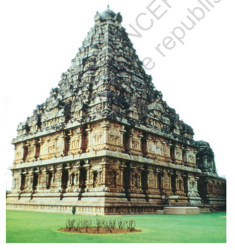
Fig. 3 The temple at Gangaikondacholapuram. Notice the way in which the roof tapers. Also look at the elaborate stone sculptures used to decorate the outer walls.

Chola temples often became the nuclei of settlements which grew around them. These were centres of craft production. Temples were also endowed with land by rulers as well as by others. The produce of this land