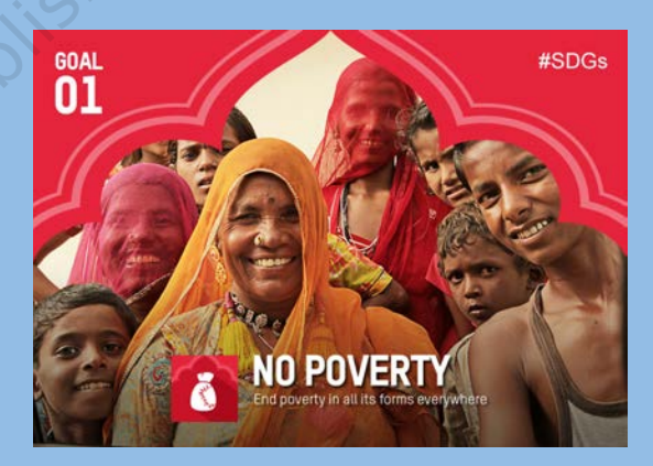
Sustainable Development Goal (SDG) www.in.undp.org

What do you think is meant by the expression 'power over the ballot box'? Discuss.