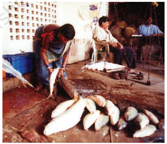
Top: Members of the TMS protesting at a rally. Above: A member of the cooperative weighing the fish.

With the TMS taking over the fishworkers were able to increase their earnings substantially. This was because they set up the cooperative which would buy the catch from them at a fair price. The cooperative would then arrange to transport and sell this in markets where they would get a good price. They have now begun to earn three times more than they earned earlier. The TMS has also begun giving the fishworkers loans for repair and the buying of new nets. By managing to earn a higher wage as well as preserving the fish in the reservoir, the TMS has shown that when people's organisations get their rights to livelihood, they can be good managers.