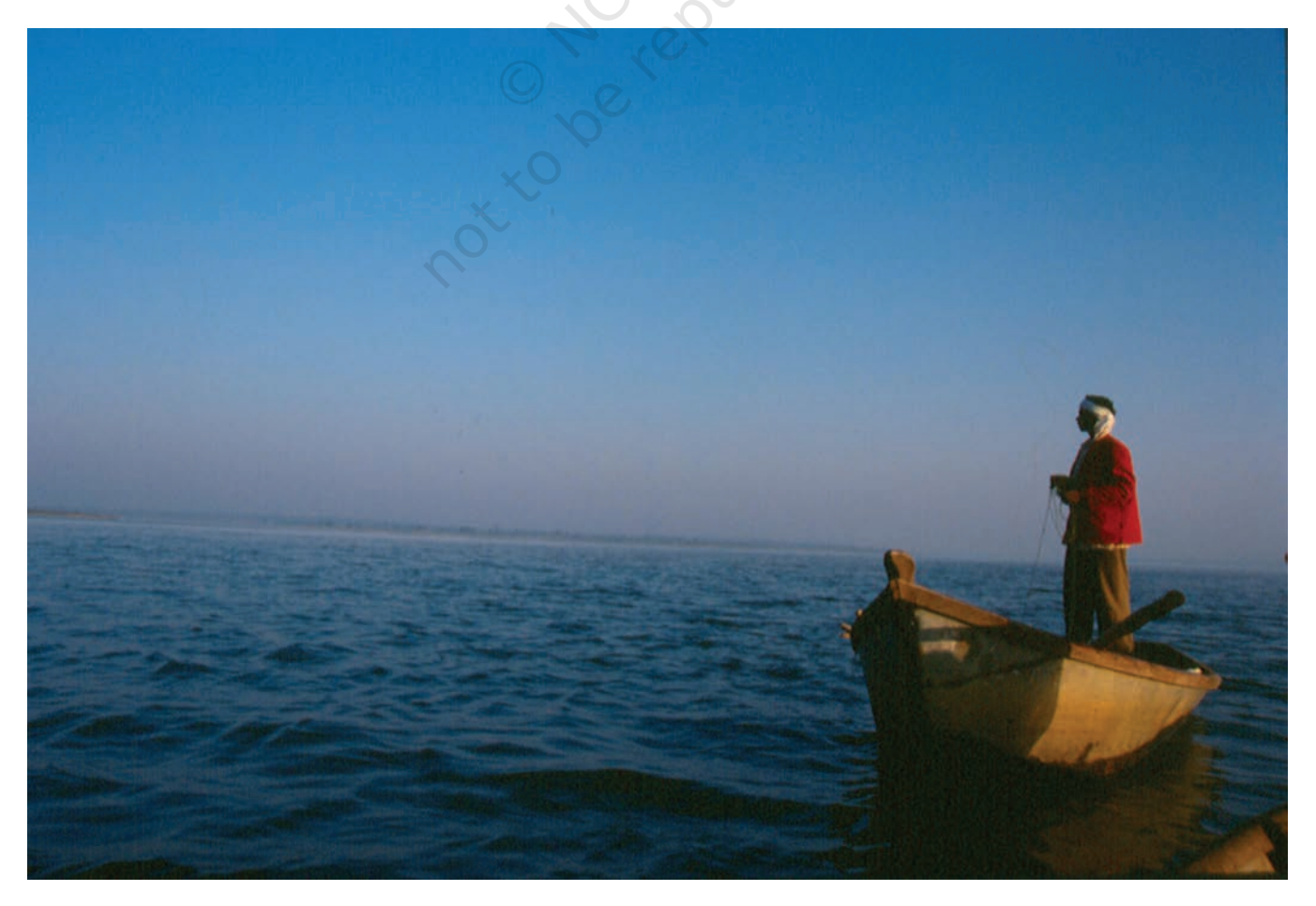
The reservoir of the Tawa river.

This displacement of people and communities is a problem that has become quite widespread in our