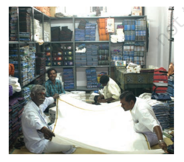
A shop in Erode.

On market days, you would also find weavers bringing cloth that has been made on order from the merchant. These merchants supply cloth on order to garment manufacturers and exporters around the country. They purchase the yarn and give instructions to the weavers about the kind of cloth that is to be made. In the following example, we can see how this is done.