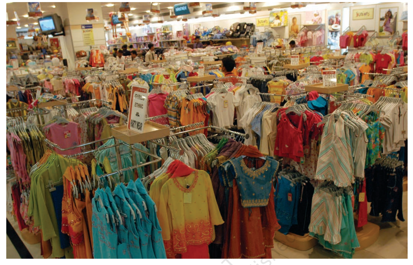
Did you know that the readymade clothes that you buy require the work of so many different persons?