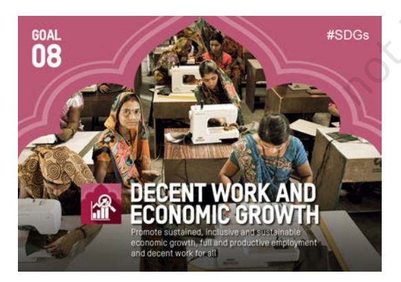
Sustainable Development Goal (SDG) www.in.undp.org

that get the maximum earnings from the market. These are the people who have money and own the factories, the large shops, large land holdings, etc. The poor have to depend on the rich and the powerful for various things. They have to depend for loans (as in the case of Swapna, the small farmer), for raw materials and marketing of their goods (weavers in the putting out system), and most often for employment (workers at the garment factory). Because of this dependence, the poor are exploited in the market. There are ways to overcome these such as forming cooperatives of producers and ensuring that laws are followed strictly. In the last chapter, we will read about how one such fish-workers' cooperative was started on the Tawa river.