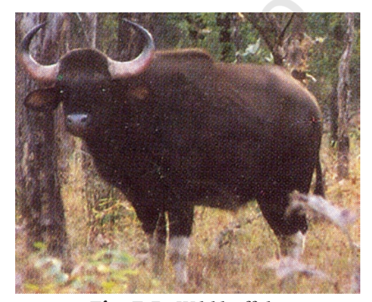
Fig. 7.5: Wild buffalo

buffaloes (Fig. 7.5) and barasingha (Fig. 7.6) were also found in the Satpura National Park. Animals whose numbers are diminishing to a level that they might face extinction are known as the endangered animals . Boojho is reminded of the dinosaurs which became extinct a long time ago. Survival of some