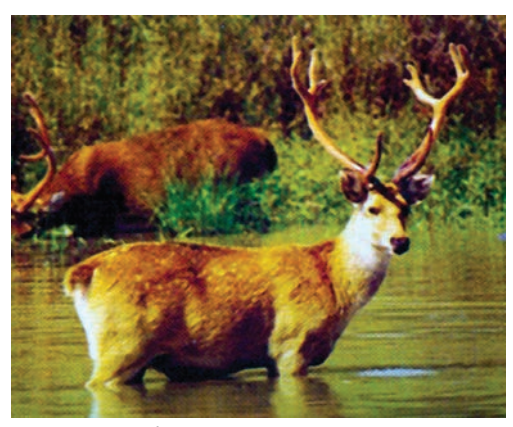
Fig. 7.6: Barasingha

animals has become difficult because of disturbances in their natural habitat. Professor Ahmad tells them that in order to protect plants and animals strict rules are imposed in all National Parks. Human activities such as grazing, poaching, hunting, capturing of animals or collection of firewood,