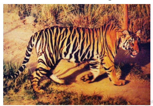
Fig. 7.4: Tiger

Tiger (Fig. 7.4) is one of the many species which are slowly disappearing from our forests. But, the Satpura Tiger Reserve is unique in the sense that a significant increase in the population of tigers has been seen here. Once upon a time, animals like lions, elephants, wild