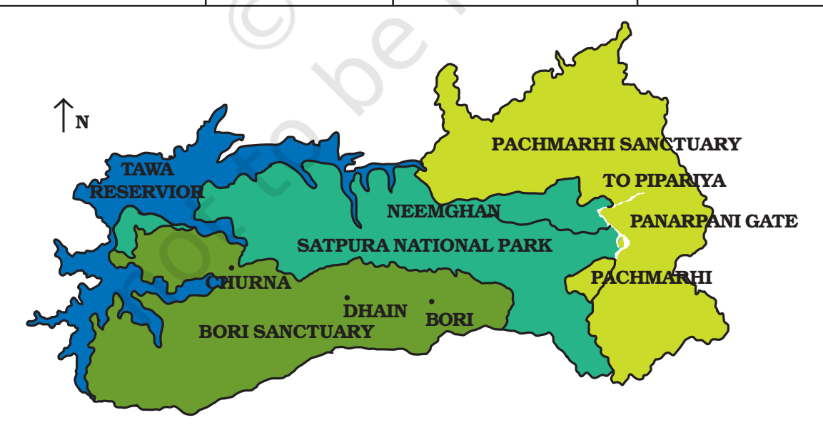
Fig. 7.1: Pachmarhi Biosphere Reserve