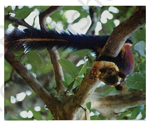
Fig. 7.3 (b): Giant squirrel

endemic flora of the Pachmarhi Biosphere Reserve. Bison, Indian giant squirrel [Fig. 7.3 (b)] and flying squirrel are endemic fauna of this area. Professor Ahmad explains that the destruction of their habitat, increasing population and introduction of new species may affect the natural habitat of endemic species and endanger their existence.