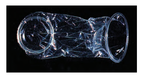
Figure 4.1(b) Condom for female