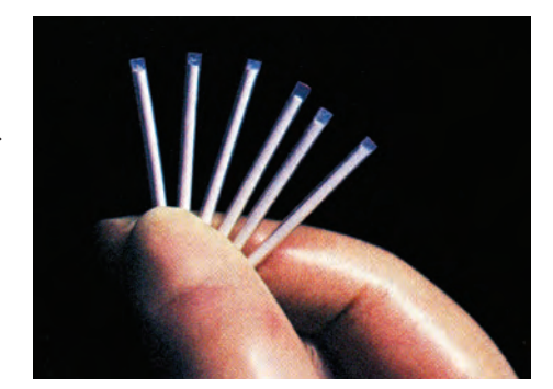
Figure 4.3 Implants

Oral administration of small doses of either progestogens or progestogen-estrogen combinations is another contraceptive method used by the females. They are used in the form of tablets and hence are popularly called the pills . Pills have to be taken daily for a period of 21 days starting preferably within the first five days of menstrual cycle. After a gap of 7 days (during which menstruation