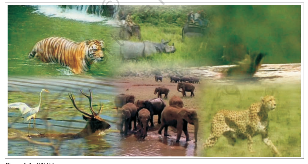
Figure 8.3 : Wildlife

In order to protect them many national parks, sanctuaries and biosphere reserves have been set up. The Government