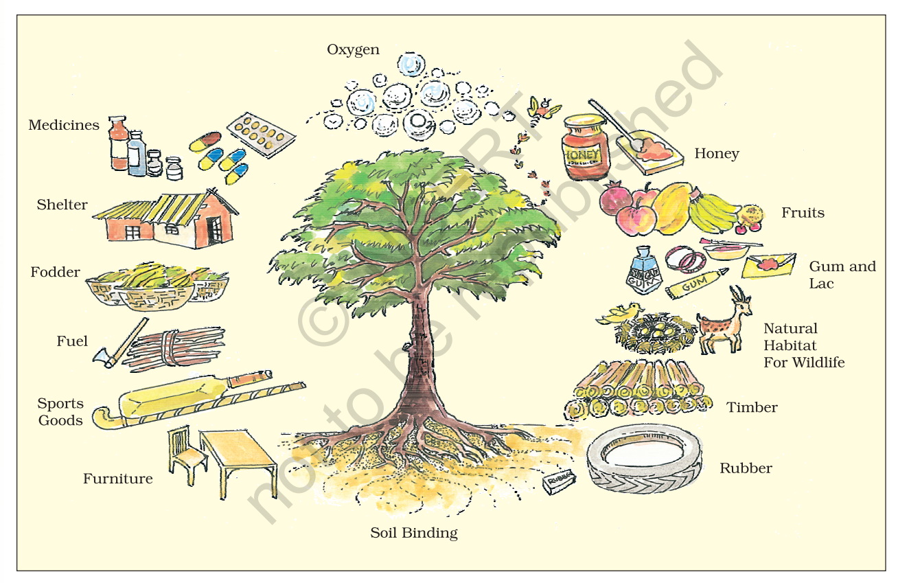
Figure 8.2 : What we get from forests

Leela's parents planted a sapling of "neem" to celebrate her birth. On each birthday, a different sapling was planted. It was watered regularly and protected from severe heat, cold and animals. Children took care not to harm it. When Leela was 20, twenty-one beautiful trees, stood in and around her house. Birds built their nests on them, flowers bloomed, butterflies fluttered around them, children enjoyed their fruits, swung on their branches and played in their shade.