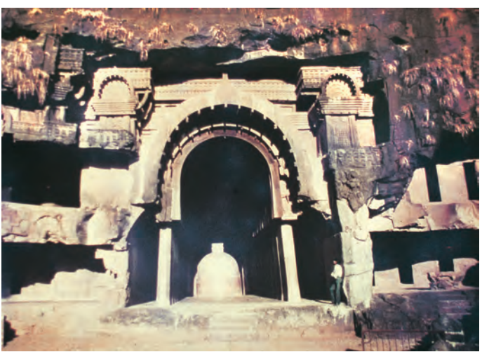
A cave at Karle, Maharashtra

Read page 100 once more. Can you think of how Buddhism spread to these lands?