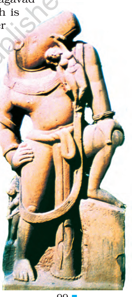
TRADERS, KINGS AND PILGRIMS

Vishnu as Varaha — an image from Eran, Madhya Pradesh. This magnificent statue is of a special form of Vishnu, the Varaha or boar. According to the Puranas (see Chapter 11) Vishnu took the shape of a boar in order to rescue the earth, which had sunk into water. Here the earth is shown as a woman.