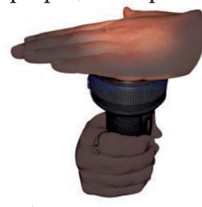
Fig. 4.9 Does torch light pass through your palm?

We can therefore group materials as opaque, transparent and translucent.