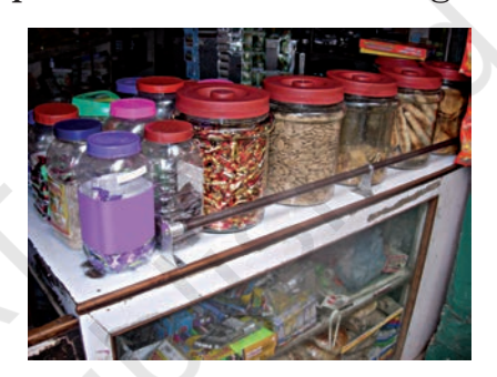
Fig. 4.8 Transparent bottles in a shop

hide behind a glass window? Obviously not, as your friends can see through that and spot you. Can you see through all the materials? Those substances or materials, through which things can be seen, are called transparent (Fig. 4.7). Glass, water, air and some plastics are examples of transparent materials. Shopkeepers usually prefer to keep biscuits, sweets and other eatables in transparent containers of glass or