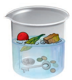
Figure 4.6 Some objects float in water while others sink in it

drops of honey that you let fall into a glass of water. What happens to all of these?