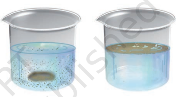
Fig. 4.4 What disappears, what doesn't?

beakers. Fill each one of them about twothirds with water. Add a small amount (spoonful) of sugar to the first glass, salt to the second and similarly, add small amounts of the other substances into the other glasses. Stir the contents of each of them with a spoon. Wait for a few minutes. Observe what happens to the substances added to water (Fig. 4.4). Note your observations as shown in Table 4.3.