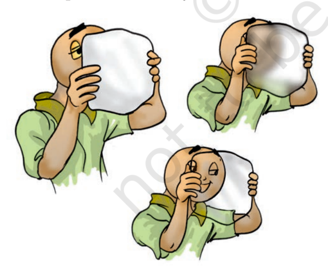
Fig. 4.7 Looking through opaque, transparent or translucent material

You might have played the game of hide and seek. Think of some places where you would like to hide so that you are not seen by others. Why did you choose those places? Would you have tried to