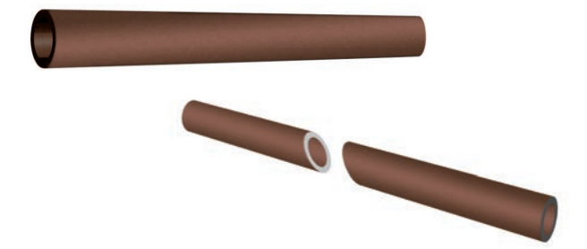
Fig. 4.3 Cutting pieces of materials to see if they have lustre

Do you notice such a shine or lustre in the other materials, cut them anyway as you can? Repeat this in the class with as many materials as possible and make a list of those with and without lustre. Instead of cutting, you can rub the surface of material with sand paper to see if it has lustre.