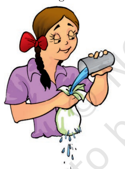
Fig. 4.2 Using a cloth tumbler

Have you ever wondered why a tumbler is not made with a piece of cloth? Recall our experiments with pieces of cloth in Chapter 3 and also keep in mind that we generally use a tumbler to keep a liquid. Therefore, would it not be silly, if we were to make a tumbler out of cloth (Fig 4.2)! What we need for a tumbler is glass, plastics, metal or other such material that will hold water. Similarly, it would not be wise to use paper-like materials for cooking vessels.