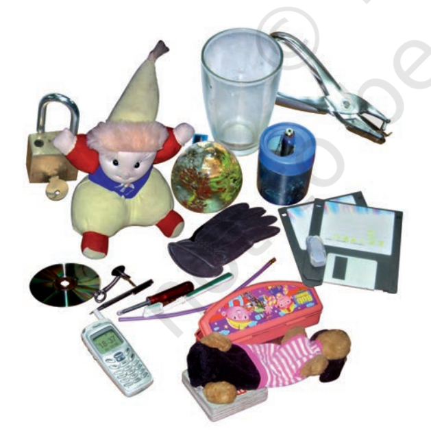
Fig. 4.1 Objects around us

Look around and identify objects that are round in shape. Our list may include a rubber ball, a football and a glass marble. If we include objects that are nearly round, our list could also include objects like apples, oranges, and an earthen pitcher (gharha). Suppose