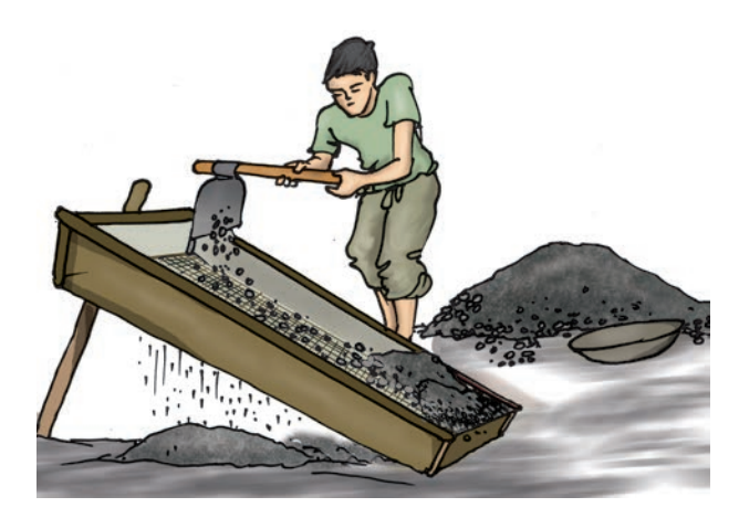
Fig. 5.7 Pebbles and stones are removed from sand by sieving

You may have also noticed similar sieves being used at construction sites