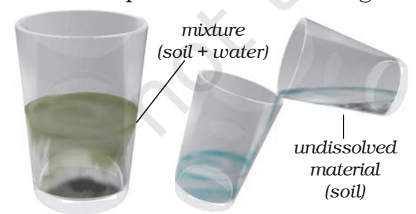
Fig. 5.8 Separating two components of a mixture by sedimentation and decantation

Let us again consider a mixure of a solid and liquid. After preparing tea, what do you do to remove the tea leaves? Usually, we use stainer to remove tea leaves. Try decantation. It helps a little. But, do you still get a few leaves in your tea? Now, pour the tea through a