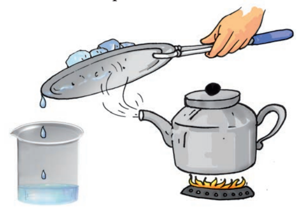
Fig. 5.13 Evaporation and condensation

Paheli faced a problem while recovering salt mixed with sand. She has mixed a packet of salt in a small