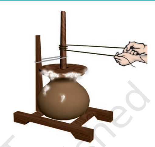
Fig. 5.2 Butter is taken out by churning milk or curd

Seems easy, but what if the materials we want to separate are much smaller