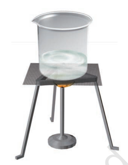
Fig. 5.11 Heating a beaker containing salt water

Add two spoons of salt to water in another beaker and stir it well. Do you