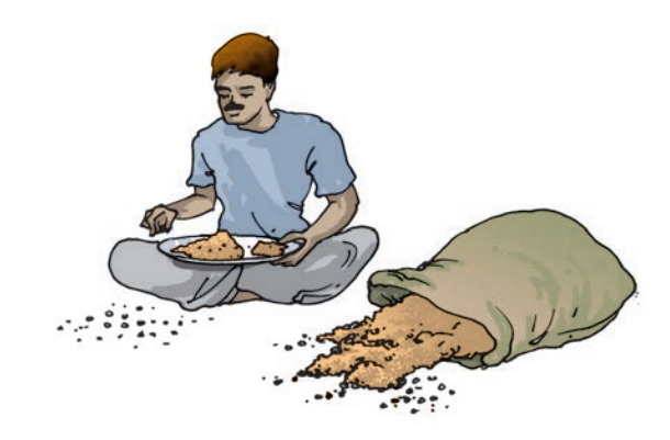
Fig. 5.3 Handpicking stones from grain

This method of handpicking can be used for separating slightly larger sized impurities like the pieces of dirt, stone, and husk from wheat, rice or pulses (Fig. 5.3). The quantity of such impurities is usually not very large. In such situations, we find that handpicking is a convenient method of separating substances.