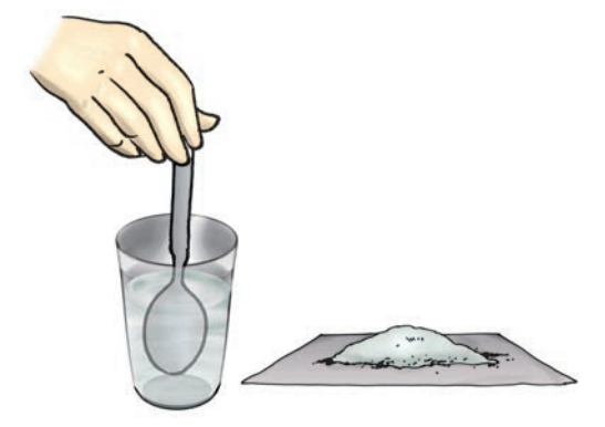
Fig 5.14 Dissolving salt in water

Here is a hint as to what might have gone wrong when Paheli tried to recover large quantity of salt mixed with sand. Perhaps the quantity of salt was much more than that required to form a saturated solution. The undissolved salt