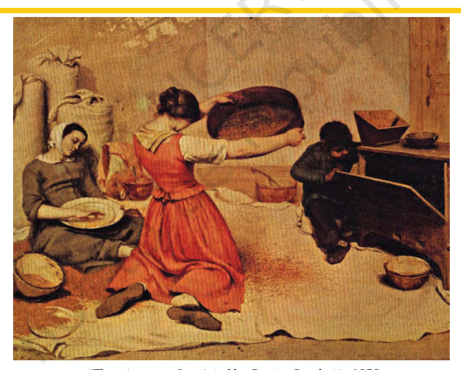
"The winnowers", painted by Gustav Courbet in 1853