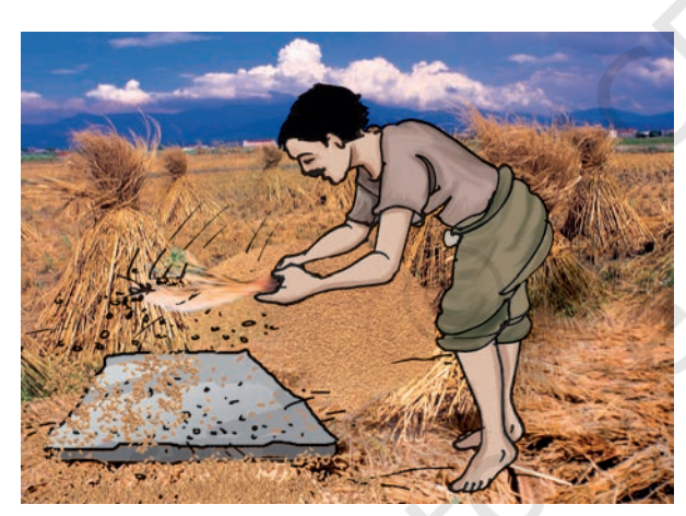
Fig. 5.4 Threshing

The process that is used to separate grain from stalks etc. is threshing . In this process, the stalks are beaten to free the grain seeds (Fig. 5.4). Sometimes,