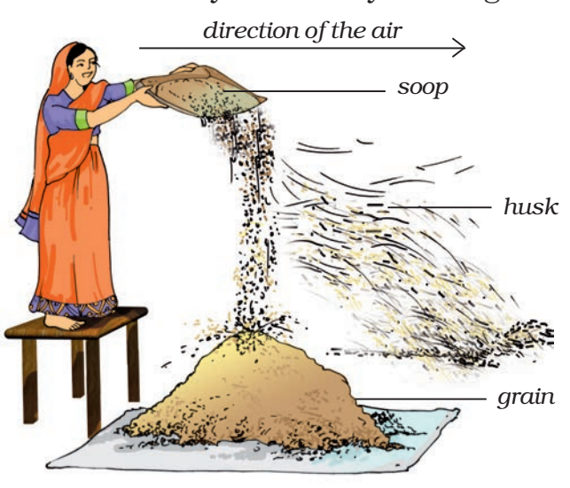
Fig. 5.5 Winnowing

This method of separating components of a mixture is called winnowing . Winnowing is used to separate heavier and lighter components of a mixture by wind or by blowing air.