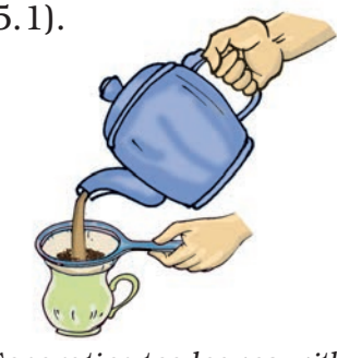
Fig. 5.1 Separating tea leaves with a strainer

Tea leaves are separated from the liquid with a strainer, while preparing tea (Fig. 5.1).