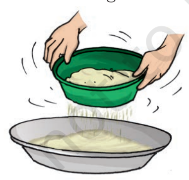
Fig. 5.6 Sieving

In a flour mill, impurities like husk and stones are removed from wheat before grinding it. Usually, a bagful of wheat is poured on a slanting sieve. The sieving removes pieces of stones, stalk and husk that may still remain with wheat after threshing and winnowing.