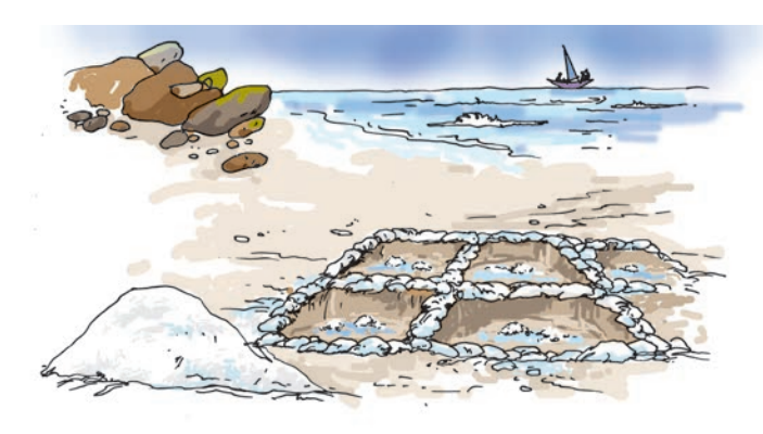
Fig. 5.12 Obtaining salt from sea water